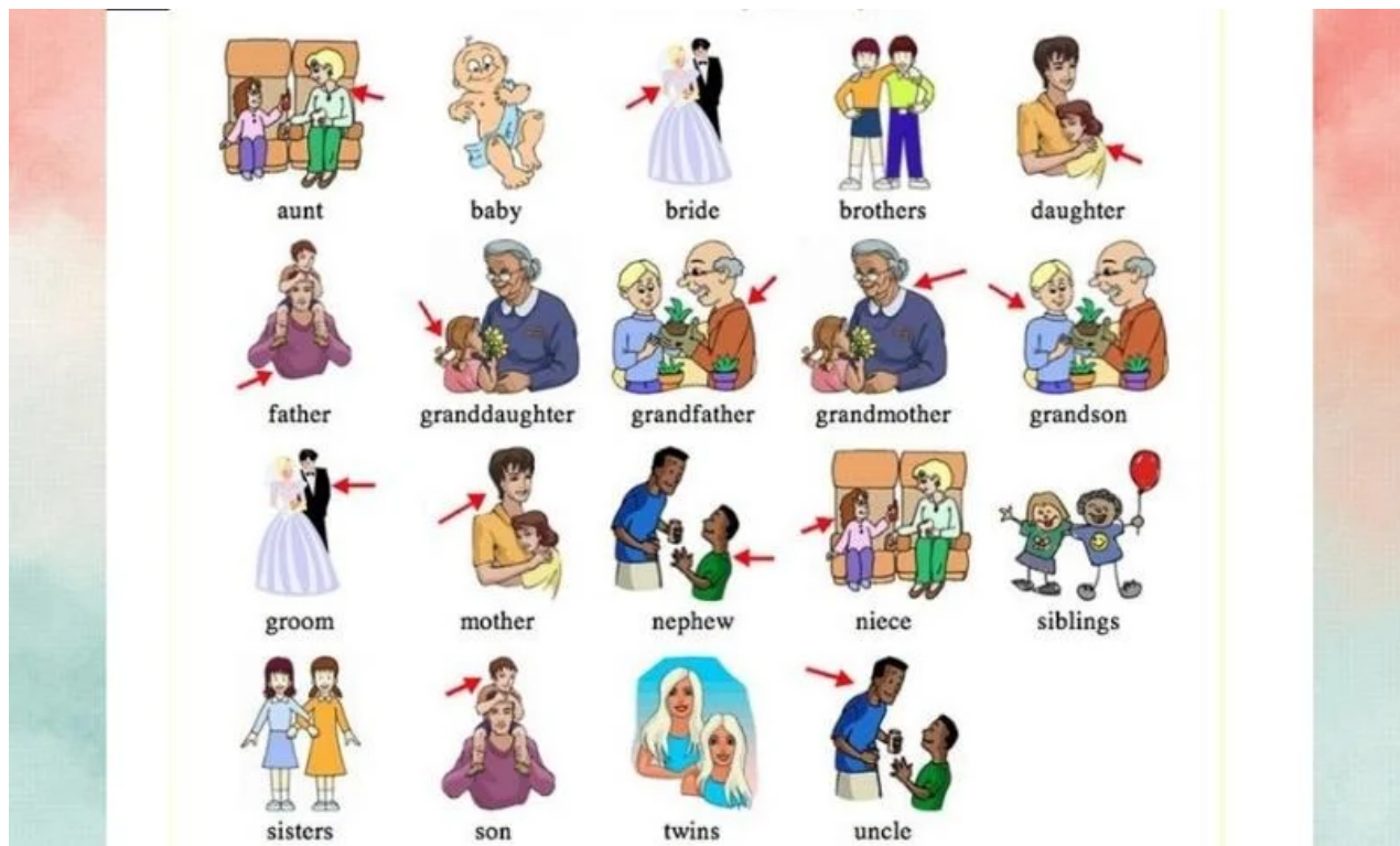
Common English Vocabulary about family

Another set of common English words related to family must be memorized