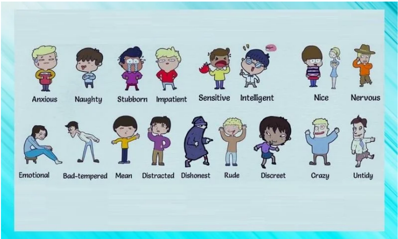
Vocabulary about personality