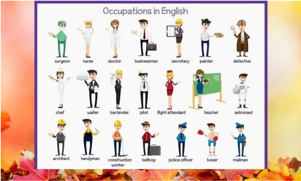
Common English Vocabulary about profession