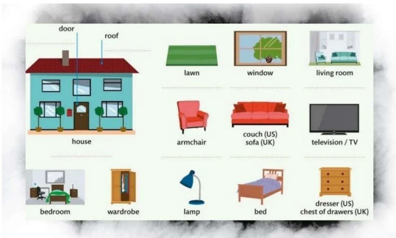
Top English Vocabulary about House

common English words and vocabularies about house with IPA and picture to memorize: